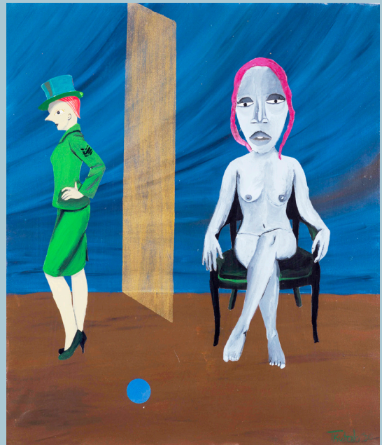
Teresa Firmino Race, Class and Shame , 2020 Est. $3,000–5,000 Price Realized: $7,200