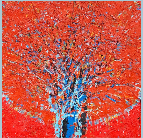
Ablade Glover Red Forest , 2007 Est. $7,000–9,000 Price Realized: $22,800