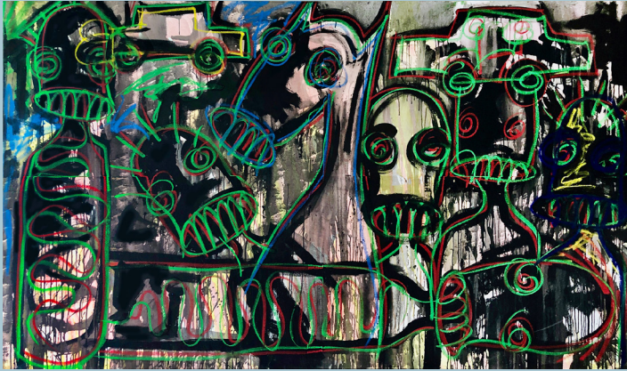
Aboudia Untitled , 2015 Est. $40,000–60,000 Price Realized: $144,000