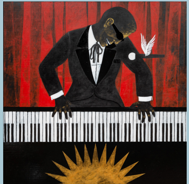
Abe Odedina Golden Ray , 2021 Est. $9,000–12,000 Price Realized: $14,400