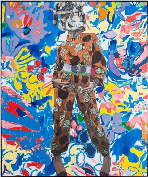
Wole Lagunju The Performance , 2018 Est. $8,000–12,000 Price Realized: $13,200