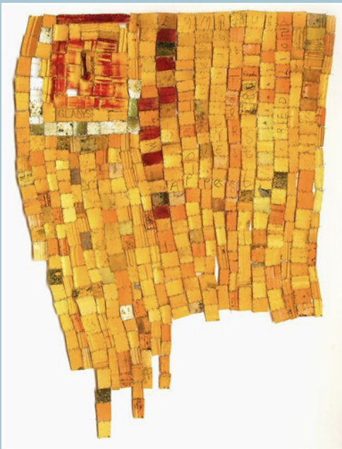
Serge Attukwei Clottey, Yellow Figure , 2014 Est. $6,000–8,000 Price Realized: $9,000